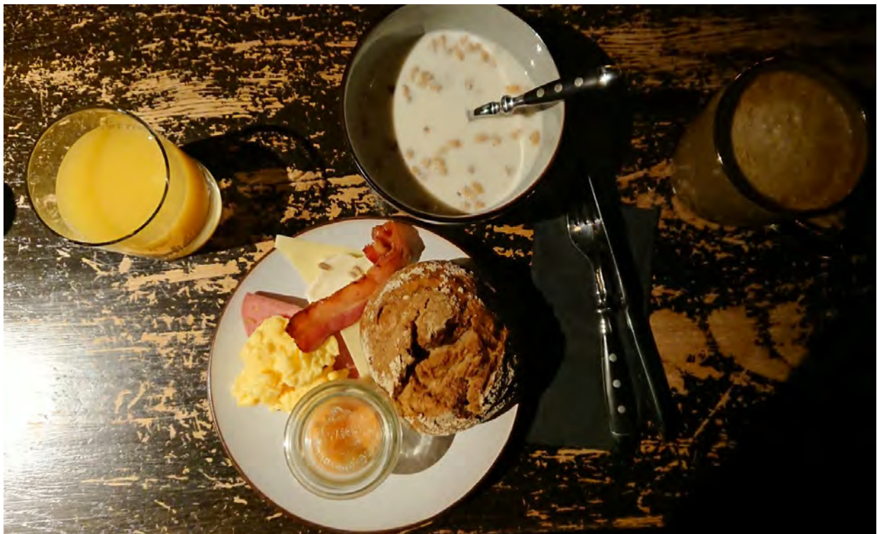
Healthy German breakfast during a conference