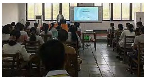
Sabe taught management course at the training school, Ministry of Construction