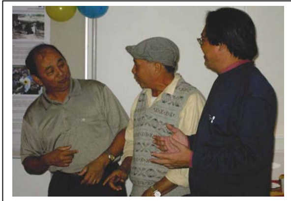
Even the Rat Pack showed up at our party to give a very special interpretation of their greatest hits.